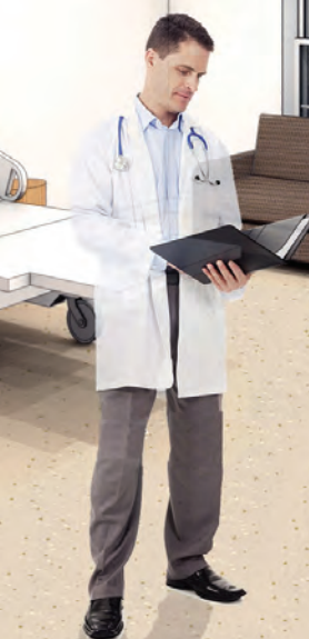
Interior rendering of a labor and delivery room inside the new hospital